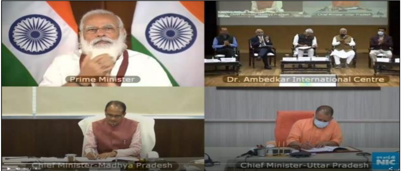
Signing of Tripartite Memorandum of Agreement for implementation of Ken-Betwa Link Project