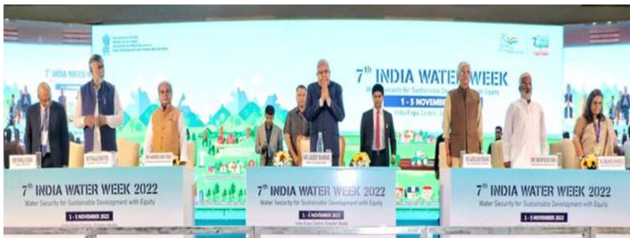
Valedictory Function of India Water Week 2022 graced by Vice President