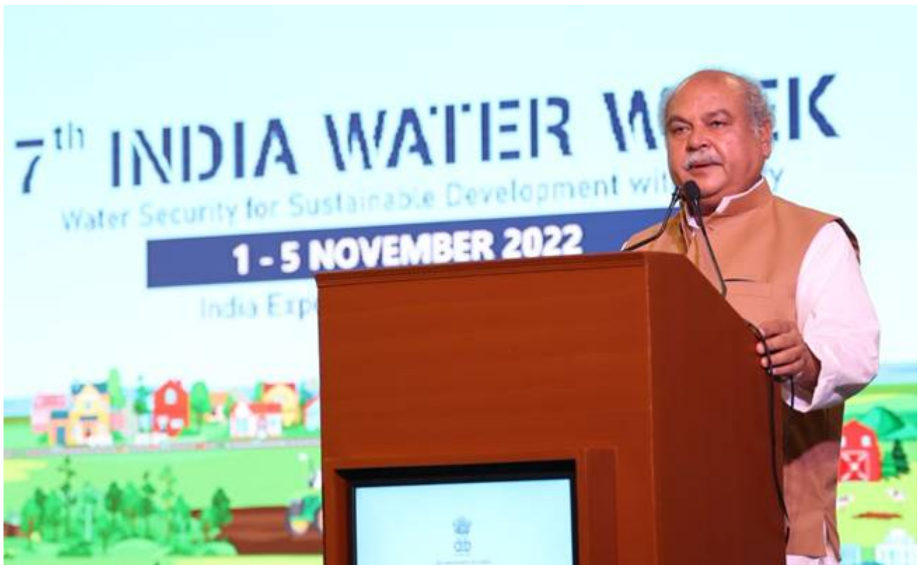
Union Minister for Agriculture & Farmer's Welfare, Shri Narendra Singh Tomar addressing the Valedictory Function