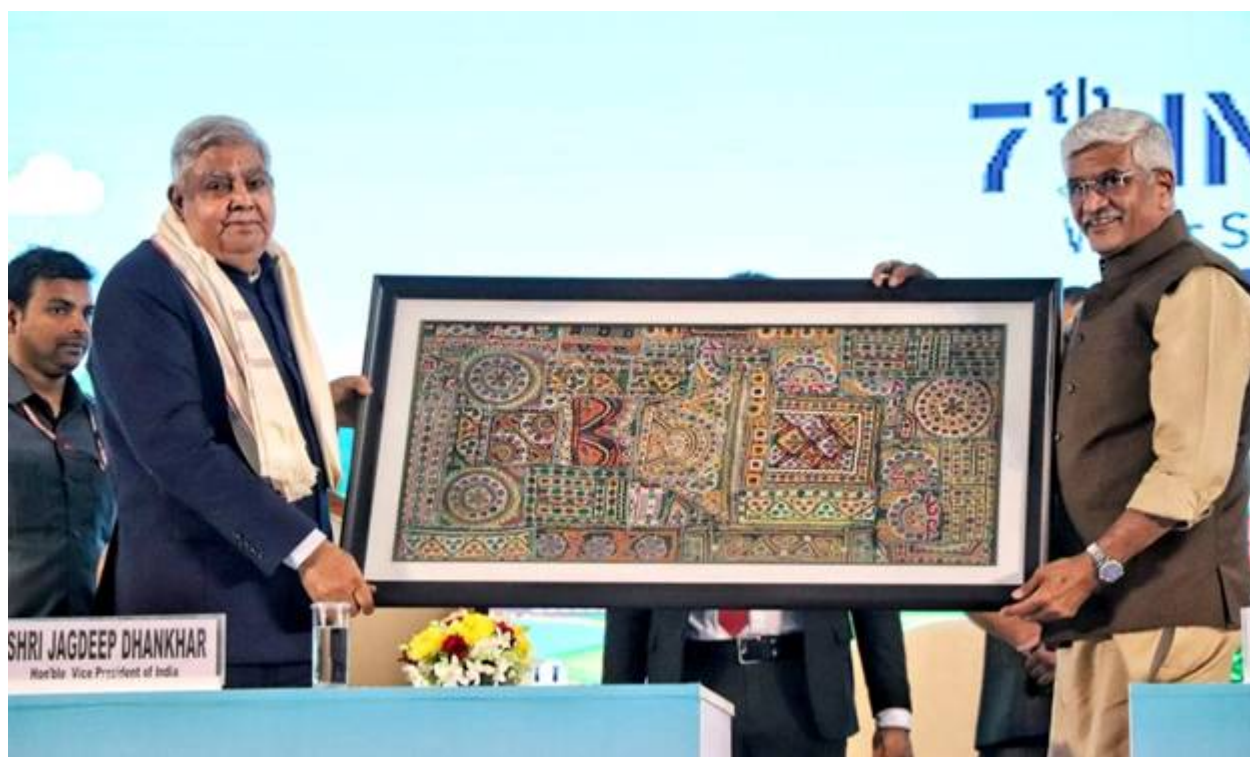
Vice President of India, Shri Jagdeep Dhankhar welcomed by Union Minister for Jal Shakti, Shri Gajendra Singh Shekhawat