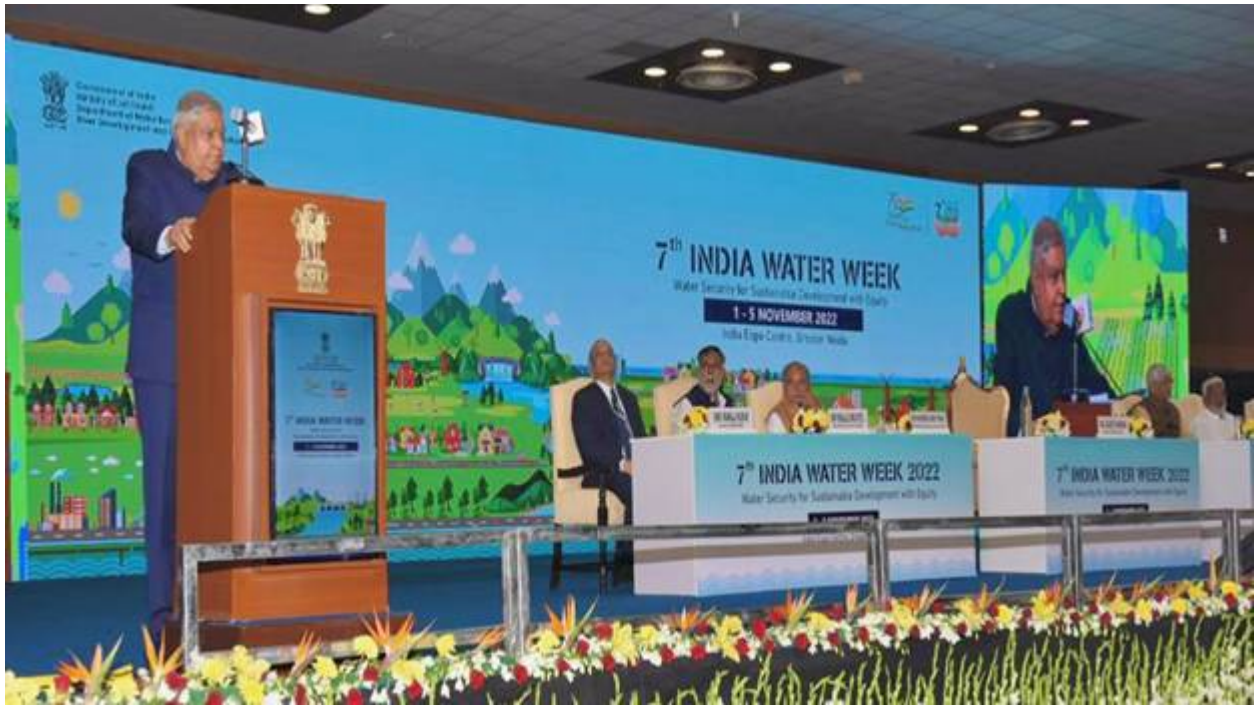
Vice President addressing the Valedictory Function of India Water Week 2022